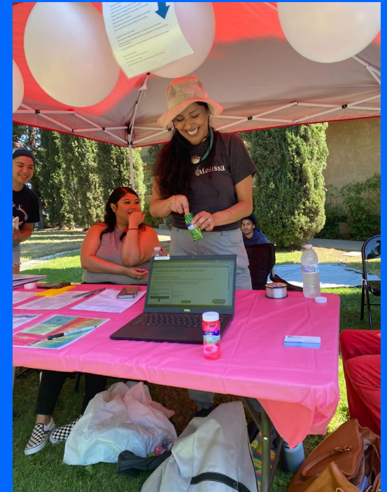
Wednesday, January 22, 2025