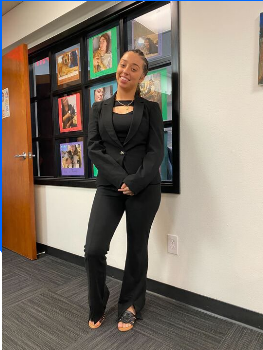
Sacramento Works Youth Committee