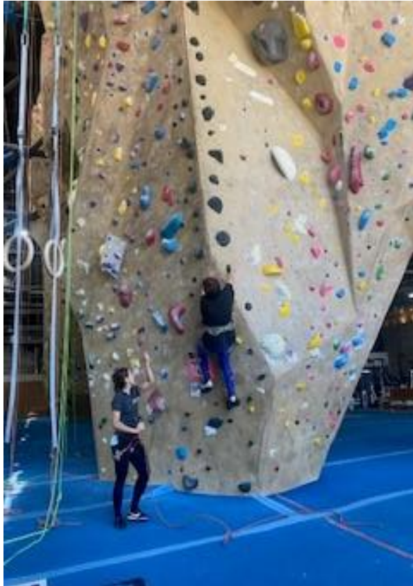
Sacramento Works Youth Committee