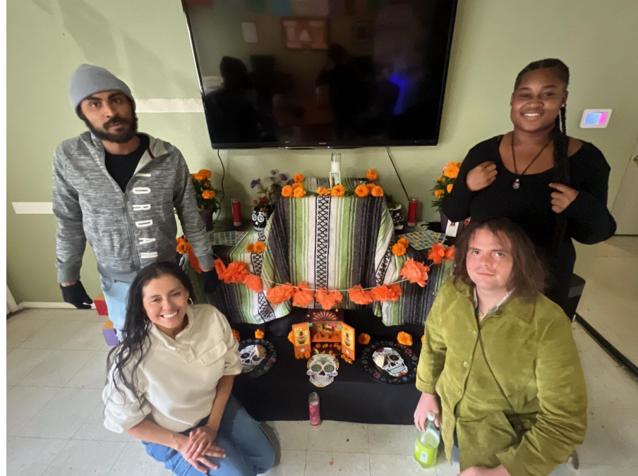
Dia de Los Muertos